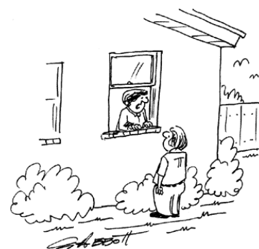
"I CAN'T COME OUT. I HAVE TO HELP MY DAD WITH MY HOMEWORK."

BY MAKING HOUSE RULES AND PERSISTING IN FOLLOWING THEM YOU ARE GIVING YOUR CHILD WHAT HE/SHE NEED AND WANT!