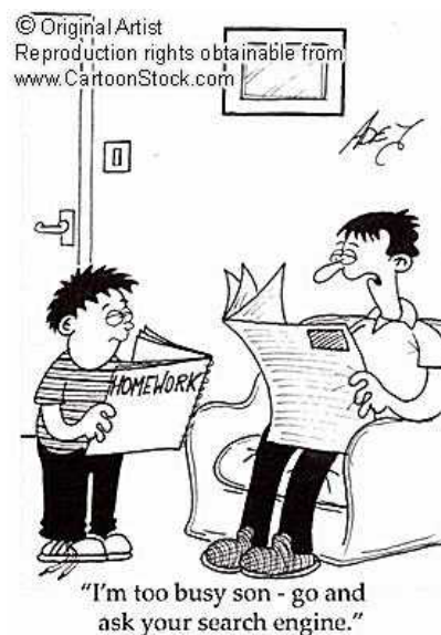
"I'm too busy son - go and ask your search engine."

The following information sets out the faculty specific homework policies and is to be used as a guide only.